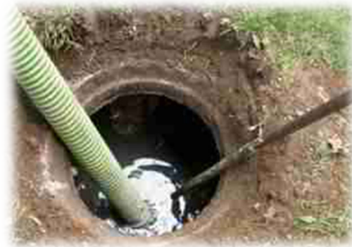
Suction machine method →