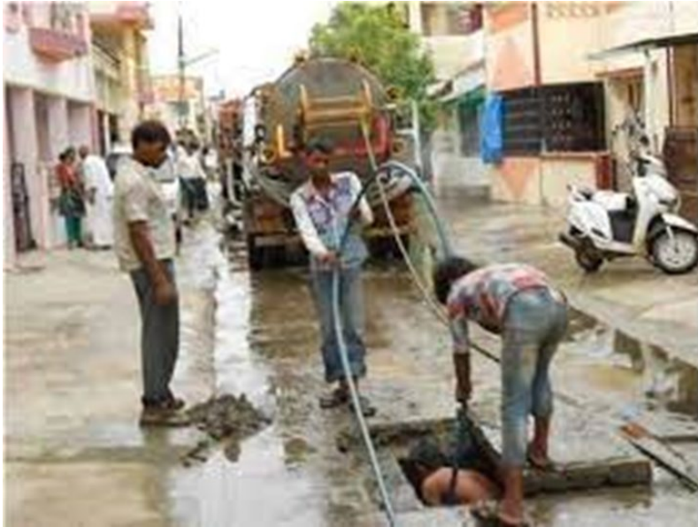
Nozzle with high pressure water jet